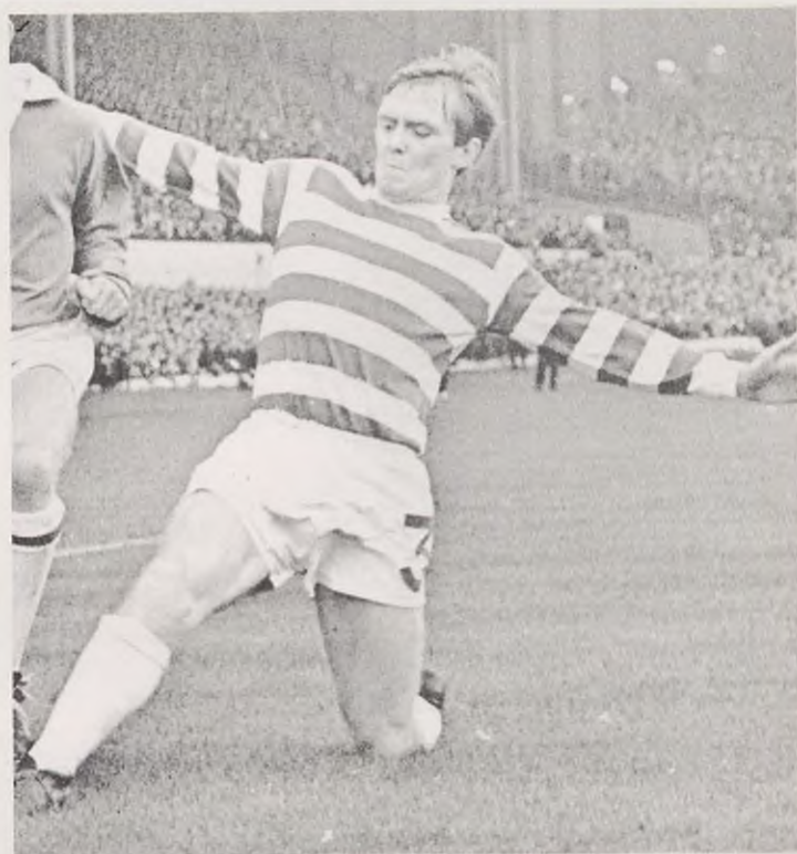
DAVIE HAY . . . displaying the midfield aggression he showed with Celtic and Scotland and now wants to instil in his Motherwell team.

Just as relegation is vehemently banned from dressing room discussions so, too, is the term promotion. But there