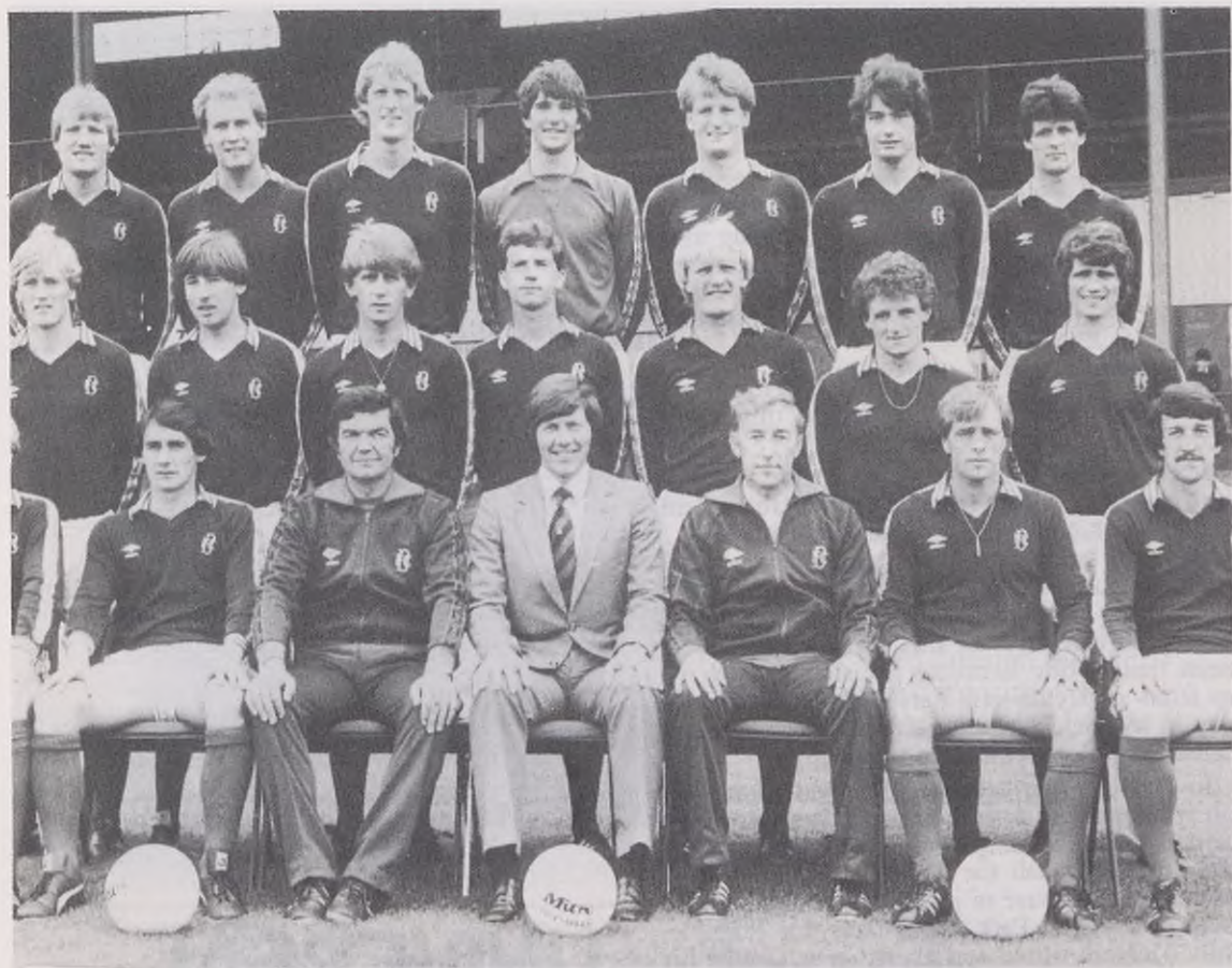
DUNDEE F. C.