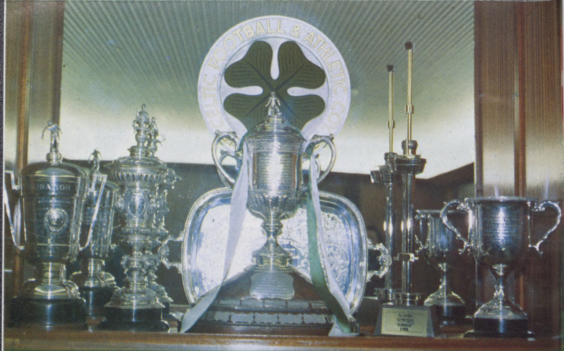
The Scottish Cup, won in the 100th Final, takes its place in Celtic's Presidential Room alongside The Coronation Cup, The St. Mungo Cup, The Rotterdam Tournament Trophy and The Victory In Europe Cup.