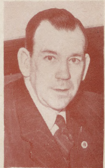
Mr. JAMES McGRORY, Manager, Celtic F.C.