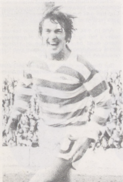
Here Kenny Dalglish exhibits the joy of scoring. It was his 22nd of the season, at Somerset Park.