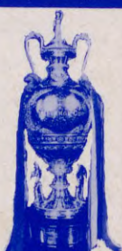
GLASGOW CUP HOLDERS: RANGERS