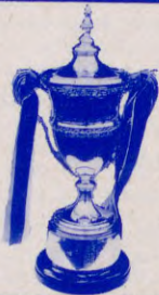
CHAMPIONSHIP CUP HOLDERS: RANGERS