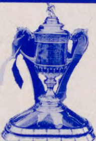
SCOTTISH CUP HOLDERS: RANGERS