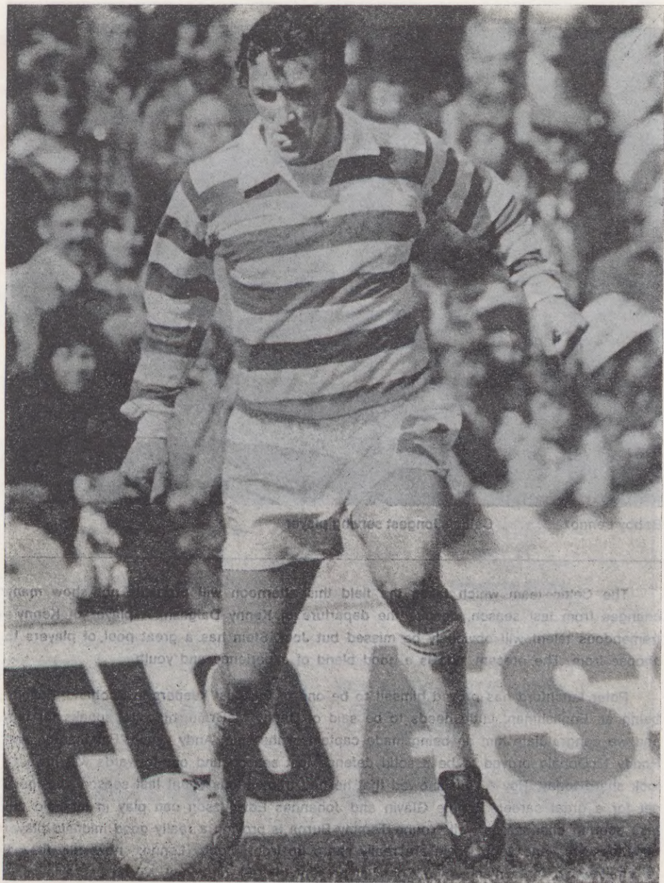
Danny McGrain: Celtic's new captain and one of the world's most entertaining Full-backs.