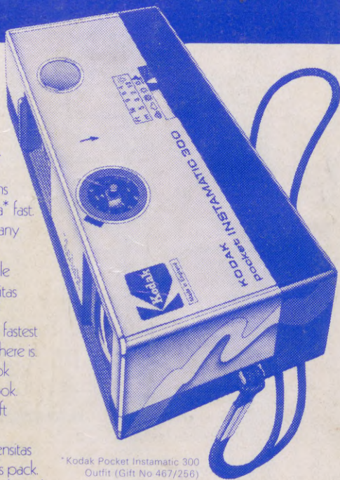
*Kodak Pocket Instamatic 300 Outfit (Gift No 467/256)

MIDDLE TAR As defined by H. M. Government EVERY PACKET CARRIES A GOVERNMENT HEALTH WARNING