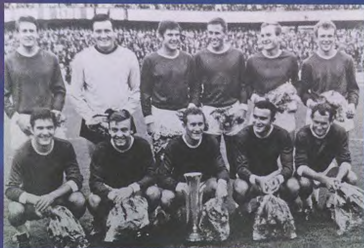
Inter-Cities Fairs Cup winners '67