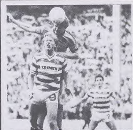
Paul Hegarty beat Mo' Johnston to this cross but the Celtic striker was on target with a header for Celtic's second last October.

Celtic—Bonner, McGrain, MacLeod, Aitken, McAdam, Grant, Provan, McStay, Johnston, Burns (McClair, 28), McGarvey (Sub. not used: Colquhoun).