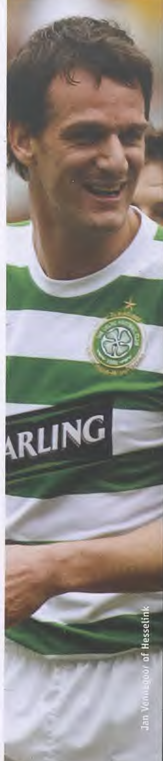
Jan Vennegoor of Hesselink