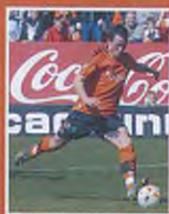
10 Match Report v Hibs