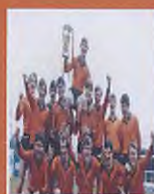
44 On the Title Trail