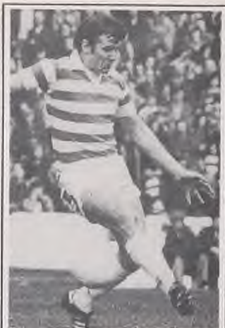
● JOHANNES EDVALDSSON

JOHANNES EDVALDSSON has been a revelation there in recent weeks, scoring a really