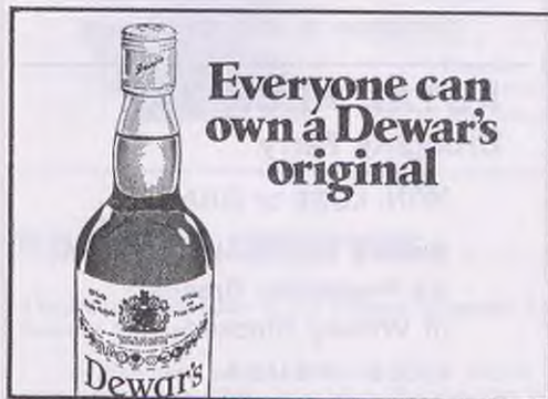
Dewar's the first to bottle the spirit of Scotland