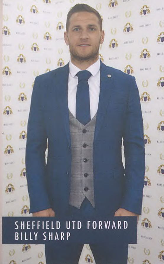
SHEFFIELD UTD FORWARD BILLY SHARP