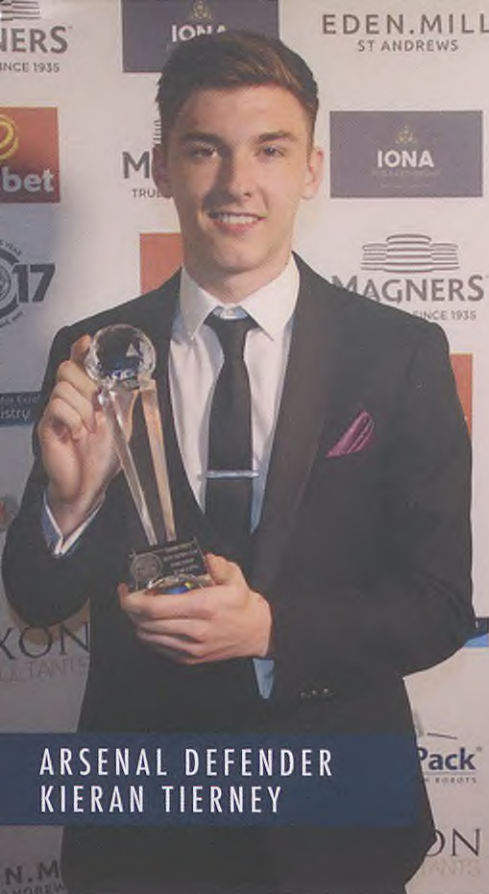
ARSENAL DEFENDER KIERAN TIERNEY