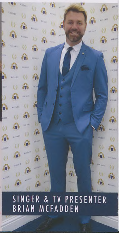
SINGER & TV PRESENTER BRIAN MCFADDEN