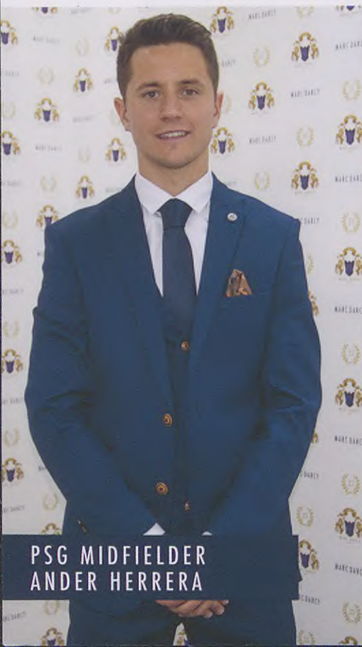
PSG MIDFIELDER ANDER HERRERA

WWW.MARCDARCY.CO.UK | 271-291 BURY NEW RD, MANCHESTER | 0161 792 9011 | SALES@MARCDARCY.CO.UK