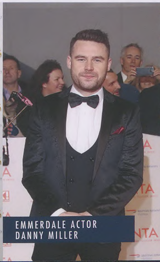
EMMERDALE ACTOR DANNY MILLER