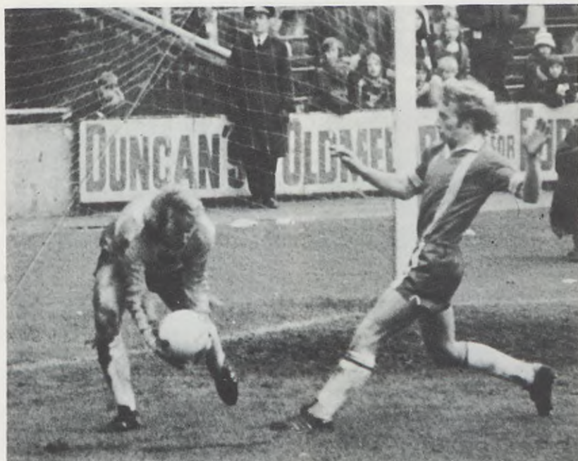
Rough foils the Dons in the Partick game last Saturday. A picture which sums up the course of the game.