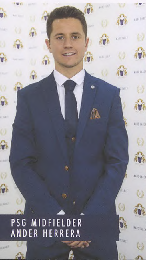
PSG MIDFIELDER ANDER HERRERA

WWW.MARCDARCY.CO.UK | 271-291 BURY NEW RD, MANCHESTER | 0161 792 9011 | SALES@MARCDARCY.CO.UK