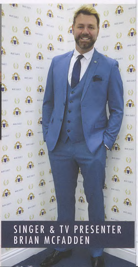
SINGER & TV PRESENTER BRIAN MCFADDEN