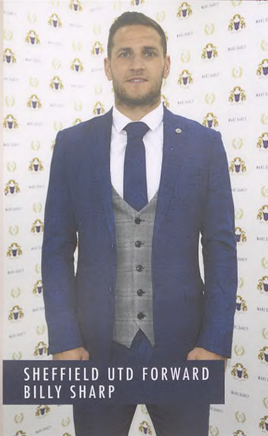
SHEFFIELD UTD FORWARD BILLY SHARP