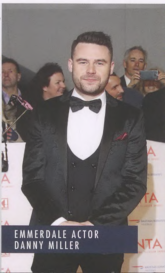
EMMERDALE ACTOR DANNY MILLER