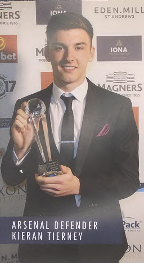
ARSENAL DEFENDER KIERAN TIERNEY