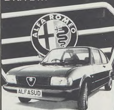
9 MODELS FROM £4900