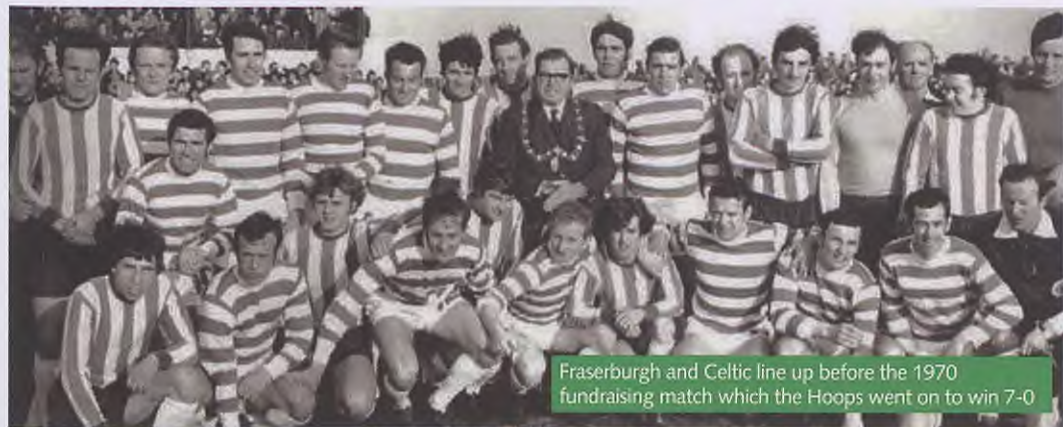
Fraserburgh and Celtic line up before the 1970 fundraising match which the Hoops went on to win 7-0

CELTIC Football Club has announced that it will be taking part in a special fundraising match this year against Fraserburgh FC in memory of the victims of the Fraserburgh Lifeboat Tragedy.