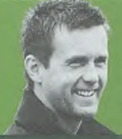
RONNY DEILA Celtic Manager