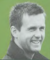
RONNY DEILA Celtic Manager