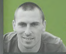
SCOTT BROWN Celtic Captain

WE'RE DETERMINED TO RETURN TO TOP OF THE TABLE AS SOON AS POSSIBLE