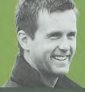
RONNY DEILA Celtic Manager