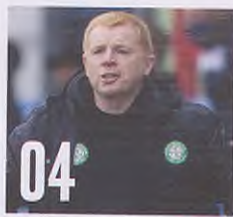
Manager - Neil Lennon