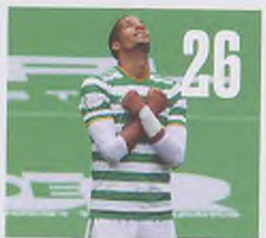
Stars In Stripes