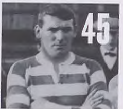
On This Day