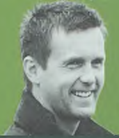
RONNY DEILA Celtic Manager