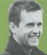
RONNY DEILA Celtic Manager