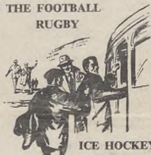
ICE HOCKEY THEATRE

Write, Phone or Call at W. ALEXANDER & SONS LTD. Private Hire Dept. CALLANDER RIGGS . FALKIRK Phone 285