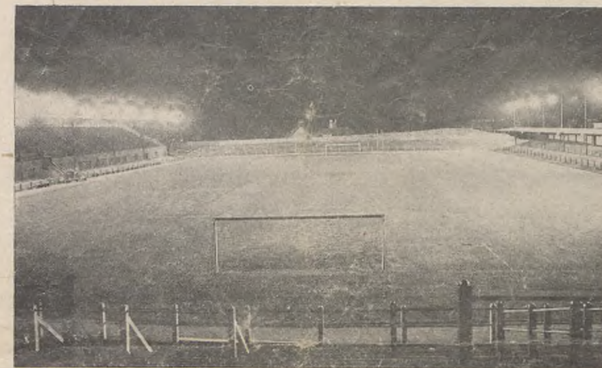
SCOTTISH LEAGUE—DIVISION A