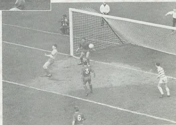
Action from the 1967 Scottish Cup Final between Aberdeen & Celtic.