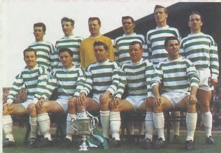
Celtic - Scottish Cup Winners, 1965, the win that provided the springboard to unprecedented success at Celtic Park.

The fact that Celtic became the first British team to win the European Cup in 1967, remains the club's pinnacle of achievement. Between 1965-1970, the Bhoys came up against the elite of Europe, and invariably, joined the exclusive club of European Cup winners when they defeated Inter Milan in Lisbon.