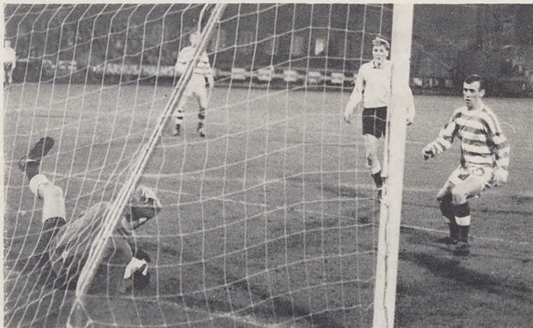
Aarhus goalkeeper saves, with Bobby Lennox in close attendance