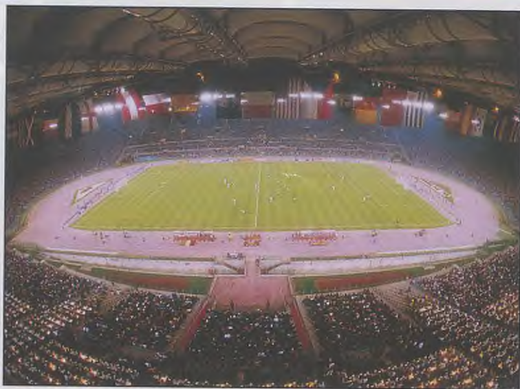
OLYMPIC STADIUM ... Roma share this fine stadium with local rivals Lazio

But that will all change if he can bring silverware to a club that last tasted such success in