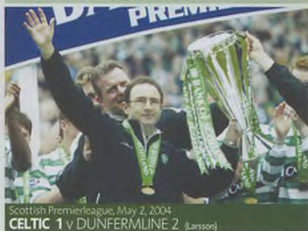
Scottish Premierleague, May 2, 2004 CELTIC 1 v DUNFERMLINE 2 (Larsson)

Scottish Premierleague, April 25, 2004 HEARTS 1 v 1 CELTIC (McGeady)