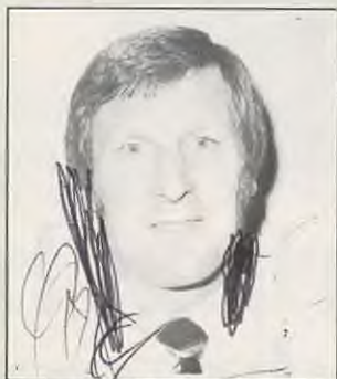
BILLY McNEILL, M.B.E.

at Easter Road on Tuesday evening which has made their task a bit more difficult.