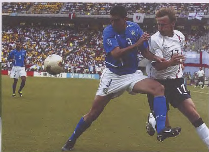
Teddy Sheringham in action for England in the World Cup quarter-final against Brazil

warm welcome to Martin O'Neill and his Scottish Premier League Champions.