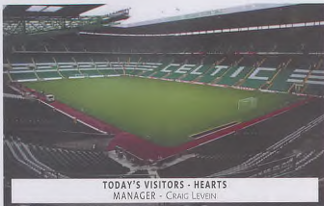
TODAY'S VISITORS - HEARTS MANAGER - CRAIG LEVEIN