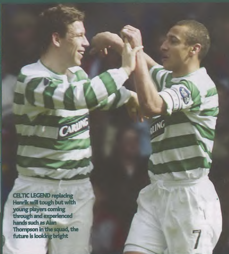
CELTIC LEGEND replacing Henrik will tough but with young players coming through and experienced hands such as Alan Thompson in the squad, the future is looking bright

Champions League which to me was down to a refereeing decision with four minutes of the final game left, but aside from that it has been a great season for us again.