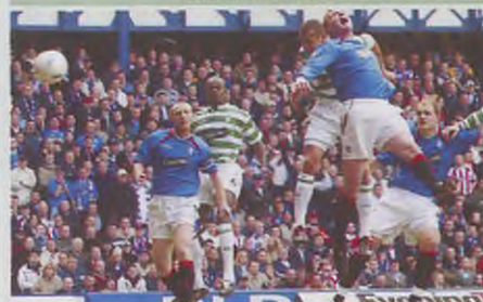
Scottish Premierleague, March 28, 2004 RANGERS 1 v 2 CELTIC (Larsson, Thompson)