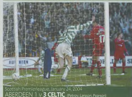
Scottish Premierleague, January 24, 2004 ABERDEEN 1 v 3 CELTIC (Petrov, Larsson, Pearson)