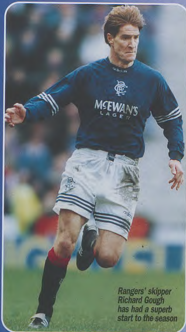
Rangers' skipper Richard Gough has had a superb start to the season