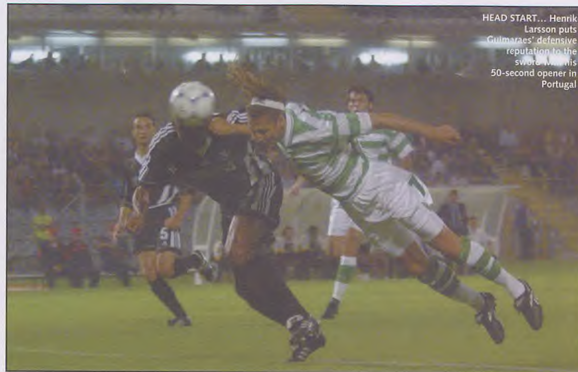
HEAD START... Henrik Larsson puts Guimaraes' defensive reputation to the sword in his 50-second opener in Portugal