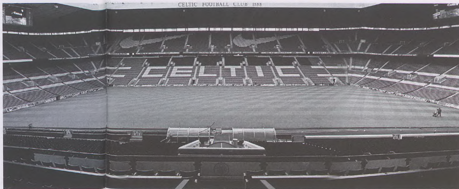
CELTIC FOOTBALL CLUB 1888