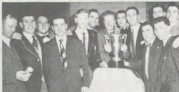
Charlie Tully, third from left, among his team mates with the Coronation Cup.

THE word charisma could have been coined for Charles Patrick Tully after he crossed the Irish Sea to join Celtic. There is no doubt that Tully was one of the most entertaining and colourful players ever to wear one of the green and white hoops. His name brings back memories of the great days of football attendances and is as familiar to younger Celtic supporters as to those fortunate enough to have seen him play.