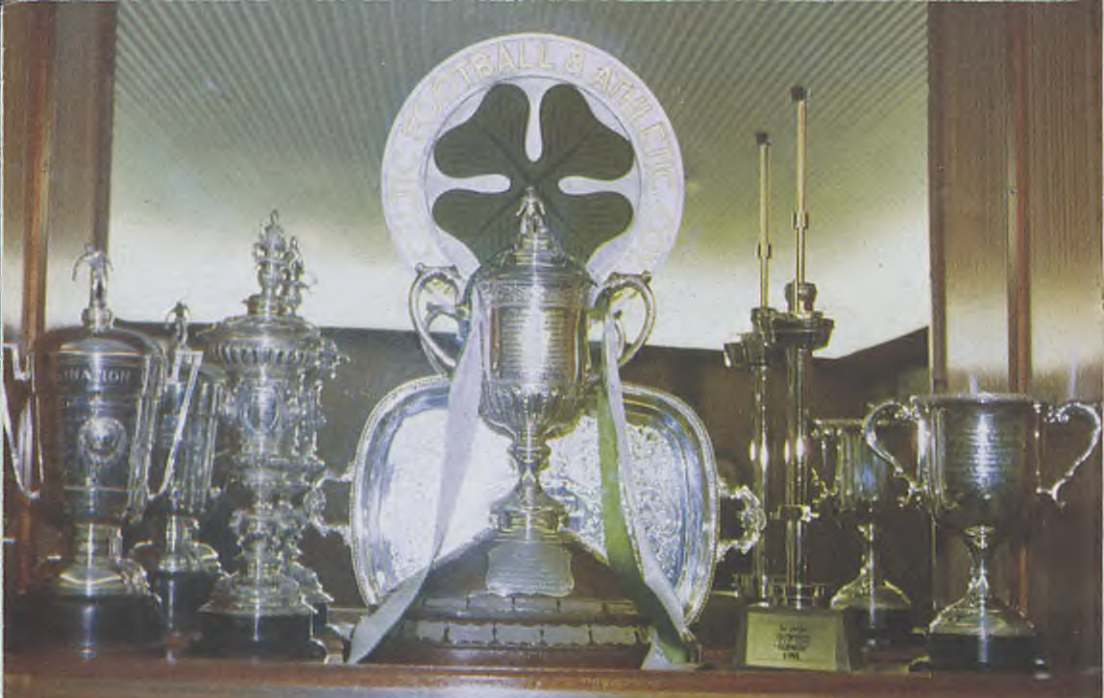
The Scottish Cup, won in the 100th Final, takes its place in Celtic's Presidential Room alongside The Coronation Cup, The St. Mungo Cup, The Rotterdam Tournament Trophy and The Victory In Europe Cup.