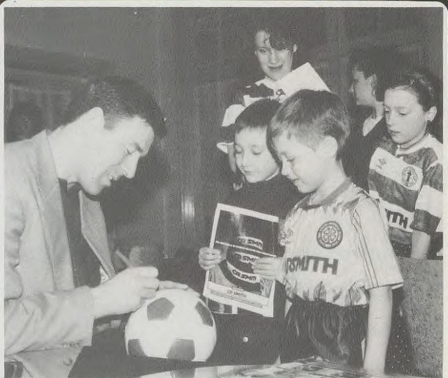
YOUNG Celtic supporters from the Isle of Bute were delighted to meet Celtic keeper Pat Bonner recently when Rothesay Glen Daly CSC held its first annual dinner dance in the resort's Glenburn Hotel.

IF YOU have any comments or suggestions regarding the Celtic Programme or wish to subscribe to have the programme sent to you direct, write to: The Celtic Programme, 18 Kerrydale Street, Glasgow, G40 3RW.