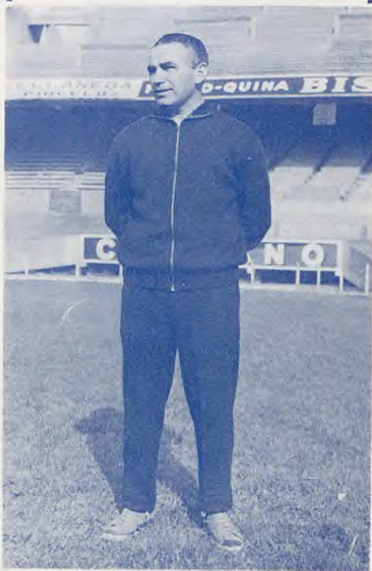
JUAN JOSE PIZZUTI

Aged 39. Was a brilliant player, both foot and head wise, and a born goalscorer. He began as manager in 1964 with Chacarita Juniors and came to our club in the middle of 1965. He truly knows how to create a team and his players go onto the field to carry out a plan which he has put to them. His greatest achievement is creating a team in which every member is important. He knows how to employ his men to the best advantage in the openings left by the opposition. Since he became manager of our professional team they have lost only two games, and, a record in South American football, they remained unbeaten during 39 official games. A feat which is renowned throughout the world. His well-wishers refer to his team as "Jose's Team."