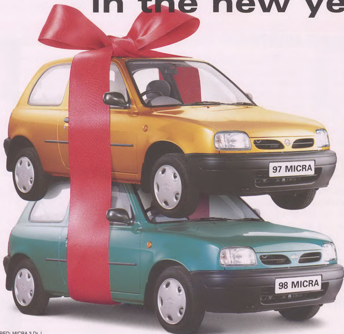
MODELS FEATURED: MICRA 3 Dr. L

Buy a '97 Micra now and we'll swap it for a '98 Micra in the new year.