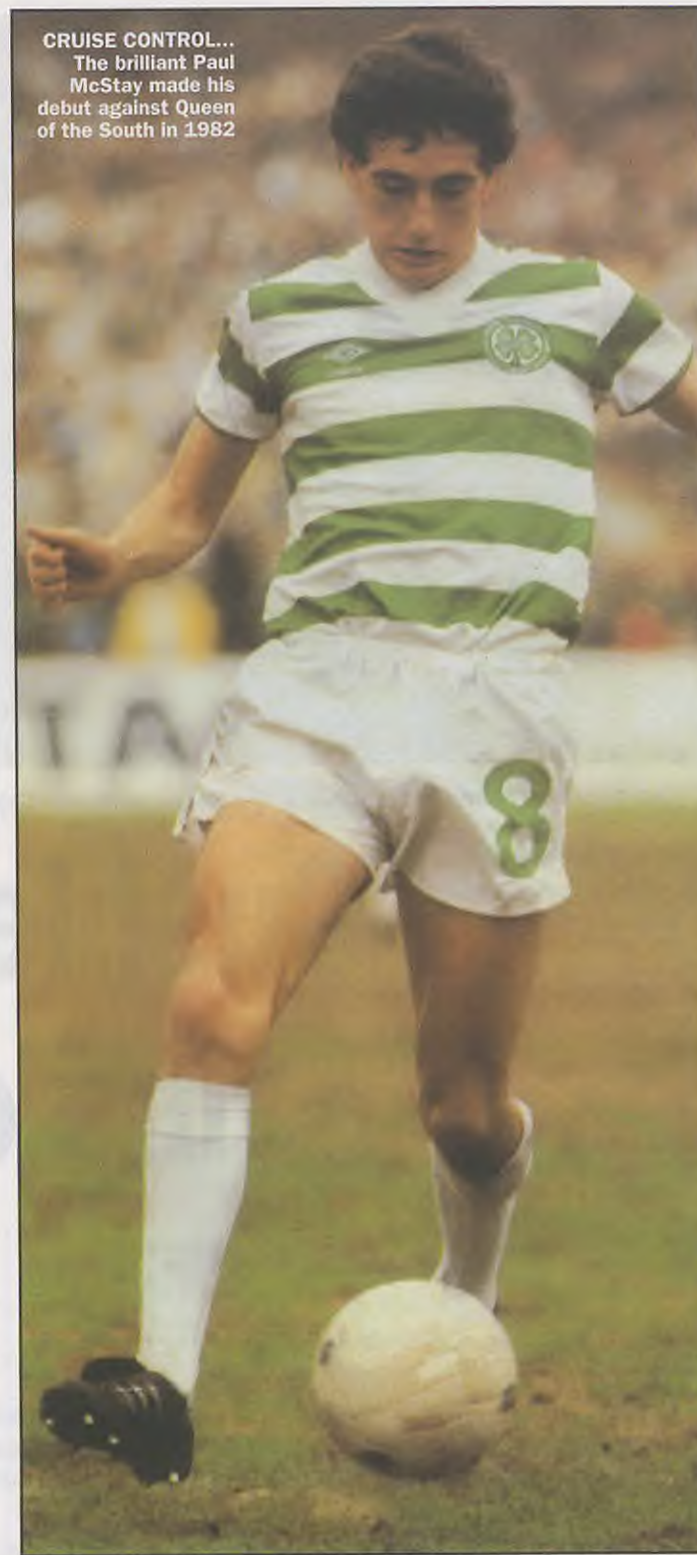
CRUISE CONTROL... The brilliant Paul McStay made his debut against Queen of the South in 1982