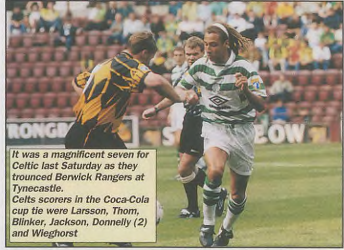
It was a magnificent seven for Celtic last Saturday as they trounced Berwick Rangers at Tynecastle. Celts scorers in the Coca-Cola cup tie were Larsson, Thom, Blinker, Jackson, Donnelly (2) and Wieghorst