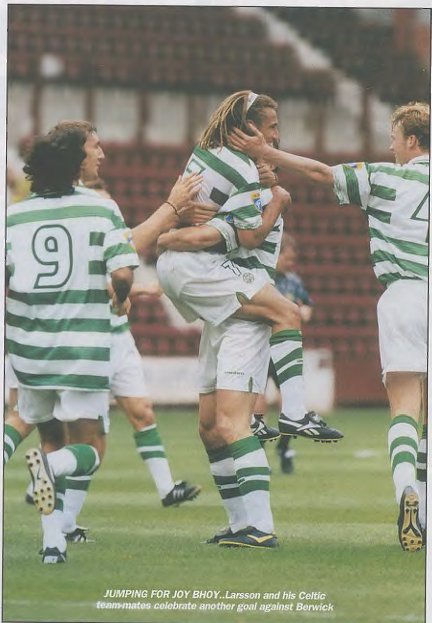
JUMPING FOR JOY BHOY.. Larsson and his Celtic team-mates celebrate another goal against Berwick

KEY: BOLD ; DENOTES HOME MATCH, pd ; Premier division, cc ; Coca-cola cup, sc ; scottish cup, uc ; uefa cup, italic ; denotes sending off, * ; denotes own goal