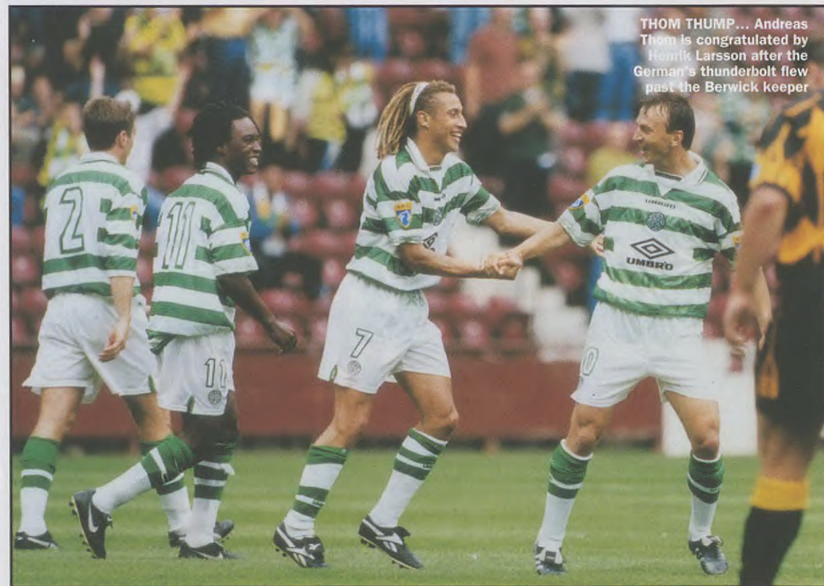
THOM THUMP... Andreas Thom is congratulated by Henrik Larsson after the German's thunderbolt flew past the Berwick keeper