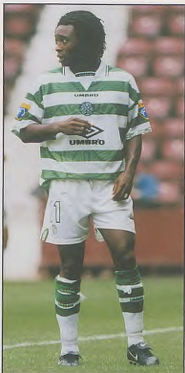
BLINKER... making a good impression