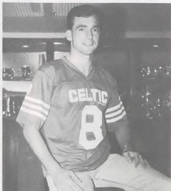
CELTIC NFL shirts are available from the Celtic Shop at Celtic Park, priced £9.95.

If you are AITKEN for more choice from your television programmes let us GRANT your wish right now. The STARK reality is C.C.V. can now provide you with the latest films — sports — music — news — in your own home. Before