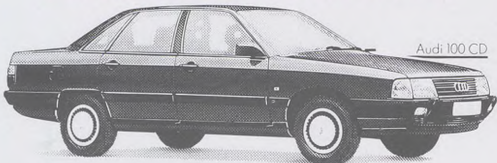
Audi 100 CD

Choose the dealer that Audi chose themselves.