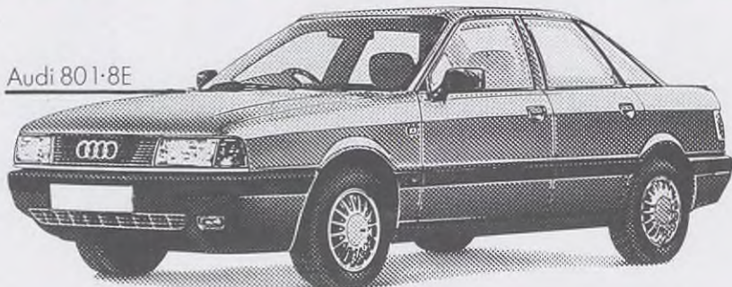
Audi 80 1-8E

Choose the dealer that Audi chose themselves.