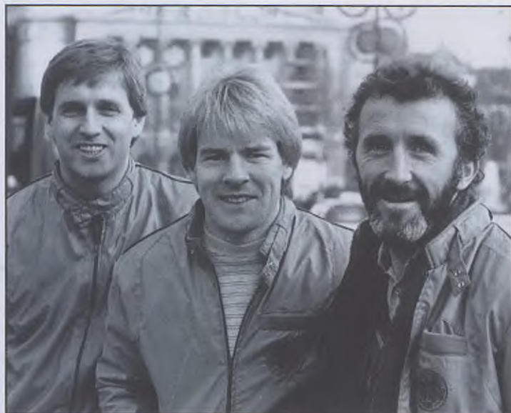
CELTIC TRIO ... Tom McAdam, Murdo MacLeod and Danny McGrain in Paradise