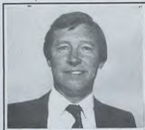
● Alex Ferguson