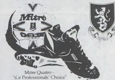
Mitre Quatro - "The Professionals' Choice"

Sole manufacturer and supplier to the Scottish Football League of the exclusive Delta design official match ball.