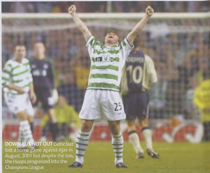
DOWN BUT NOT OUT Celtic last lost a home game against Ajax in August, 2001 but despite the loss, the Hoops progressed into the Champions League

“It was uncomfortable for the players and very slippery. You can't play with proper boots and at