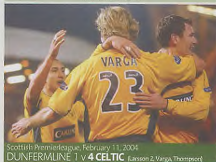
Scottish Premierleague, February 11, 2004 DUNFERMLINE 1 v 4 CELTIC (Larsson 2, Varga, Thompson)