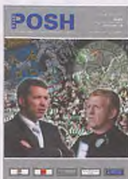
Front Cover The two bosses go head to head