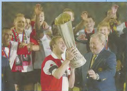
Feyenoord's Paul Bosvelt receives the UEFA Cup trophy following his side's 3-2 defeat of BV Borussia Dortmund in the 2001/02 final

Inter, Juventus and Liverpool share the record of three UEFA Cup final successes apiece. Real Madrid CF, Tottenham Hotspur FC, Parma AC, VfL Borussia Mönchengladbach, IFK Göteborg and Feyenoord have all won the competition twice.