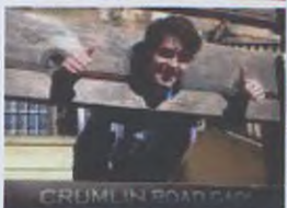
CRUMLIN ROAD GAOIL