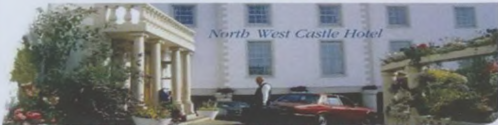
North West Castle Hotel

Providers of pre-match meals to Stranraer F.C. for season 2015/16