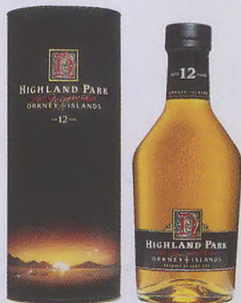
Orkney caught in a single malt by Highland Park .