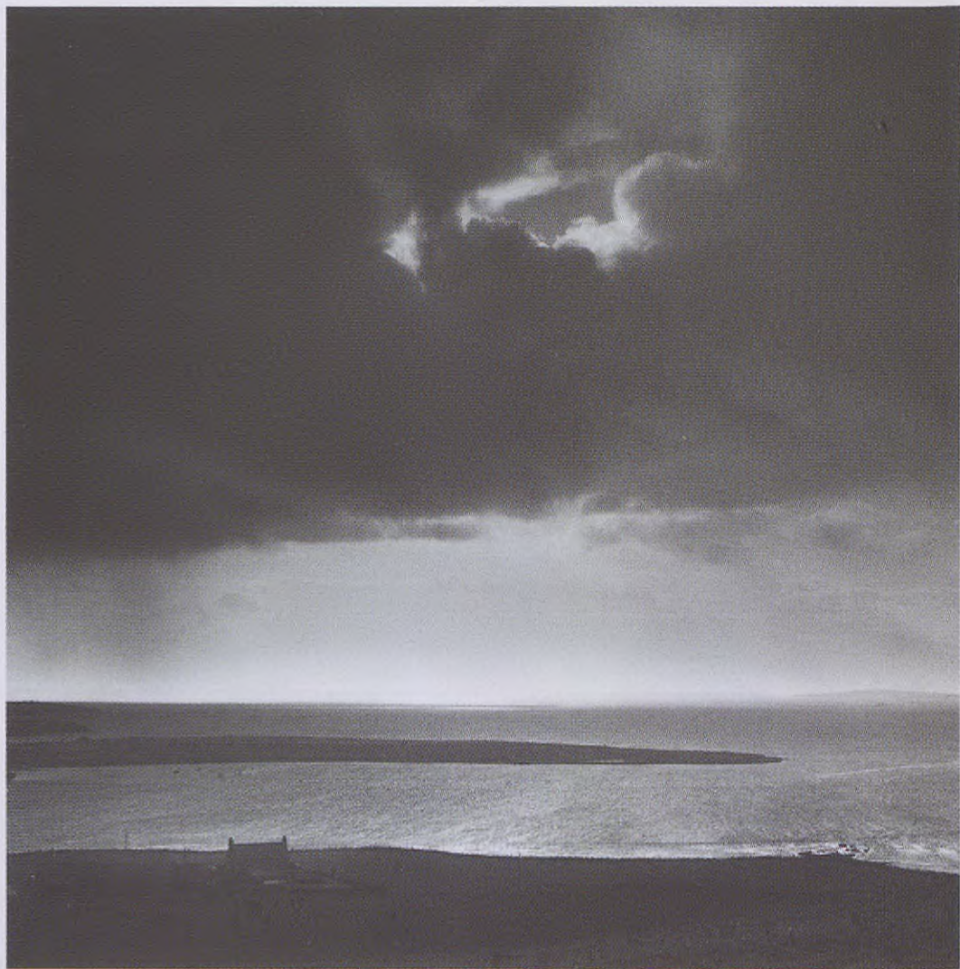
Orkney caught in a single moment by Don McCullin .