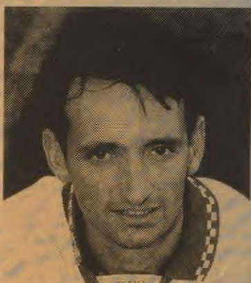
Pat Nevin A superb double